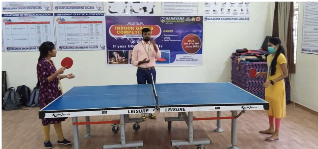
Playing Table-Tennis by Girls