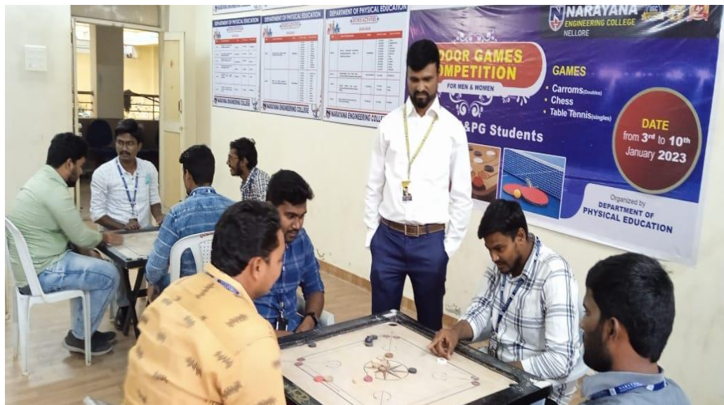
Playing Carroms by Boys