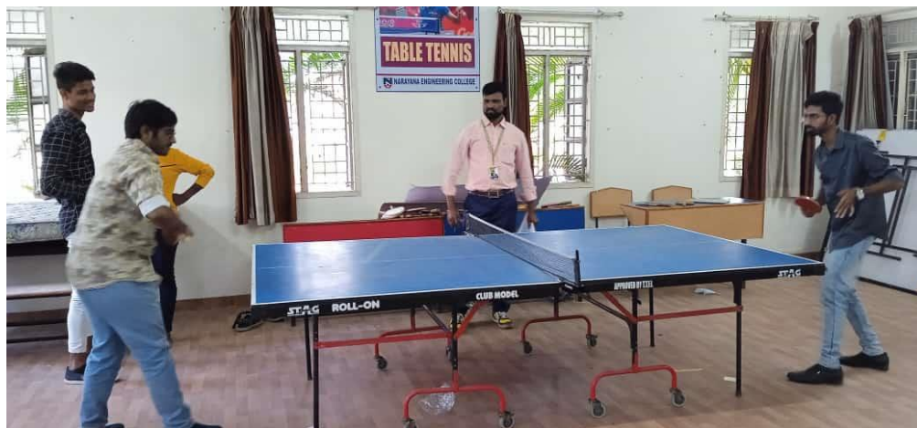
Playing Table-Tennis by Boys