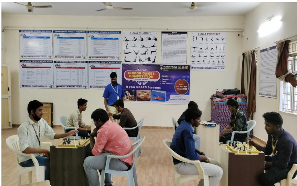
Playing Chess by Boys